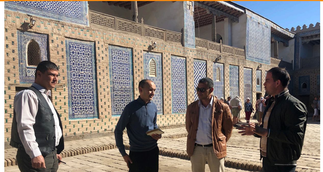
Museum colleagues discuss conservation techniques in the Tash Khauli Palace and Harem in Khiva, Uzbekistan.