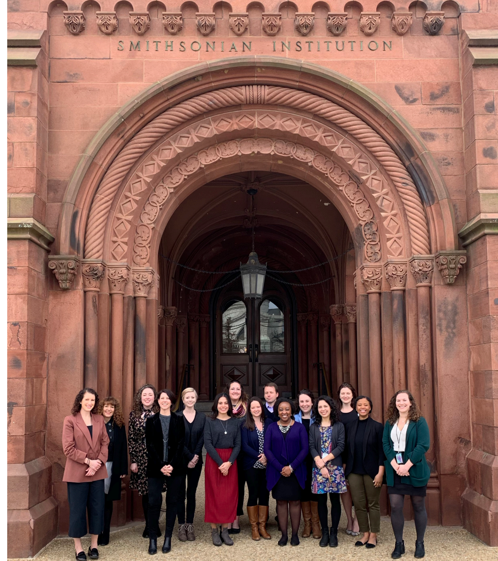
The 2019 Smithsonian Office of International Relations team.