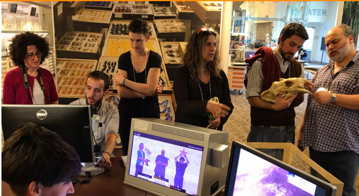
Argentina program participants explore the educational collection at the National Museum of Natural History's Q?rius Learning Lab.

How the reciprocal exchange of museum best practices can strengthen the global cultural sector