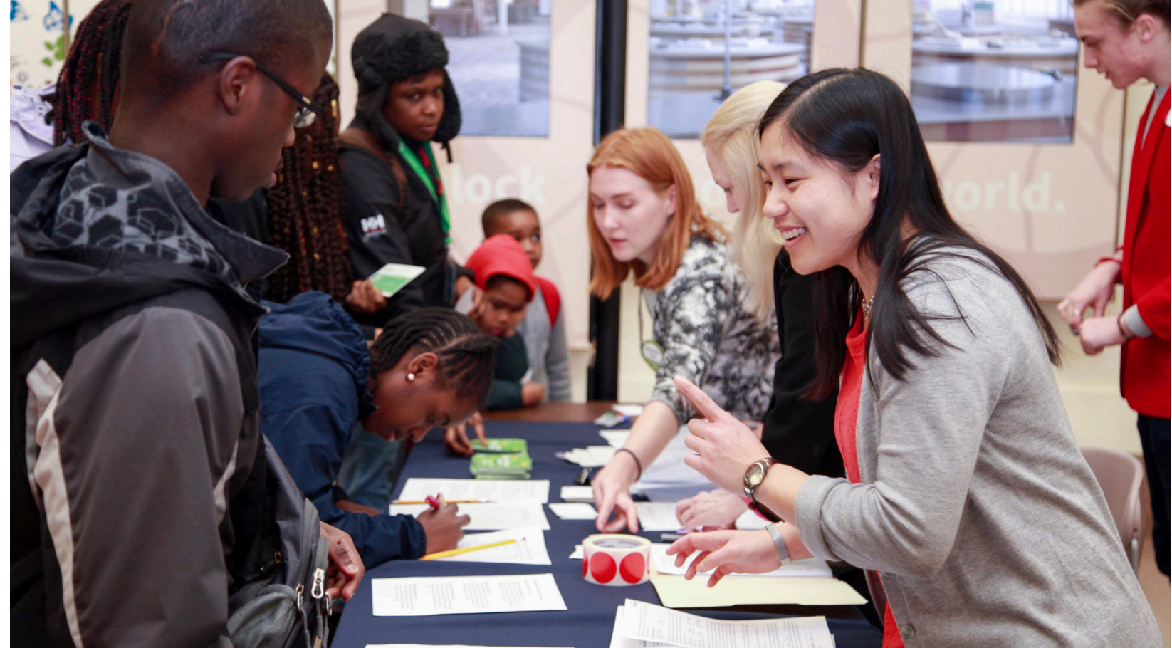
A 2019 Teen Earth Optimism event promoting sustainable food systems solutions.

five units that will fund innovative applied solutions using existing research and work from Myanmar to Gabon to Panama. High-profile projects like the Smithsonian Tropical Research Institute's Agua Salud Project and the National Museum of Natural History's Healthy Reefs for Healthy People initiative have received support and have been linked together in a global strategy and network to elevate the work and impact of Smithsonian experts. Coupled with this grant program, the Working Landscapes and Seascapes team has created a One Smithsonian strategy to better utilize Smithsonian science to address issues affecting environmental health, economic production, and community engagement across a number of key landscapes and seascapes where there has been a long legacy of Smithsonian research and data.