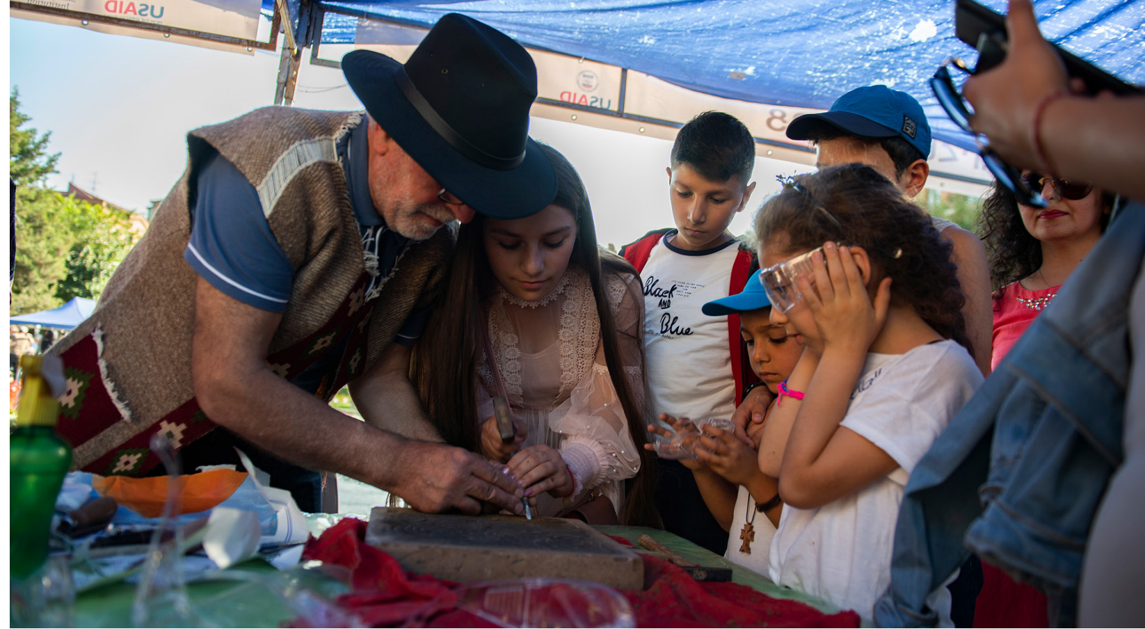
A moment from the My Handmade Armenia Festival.