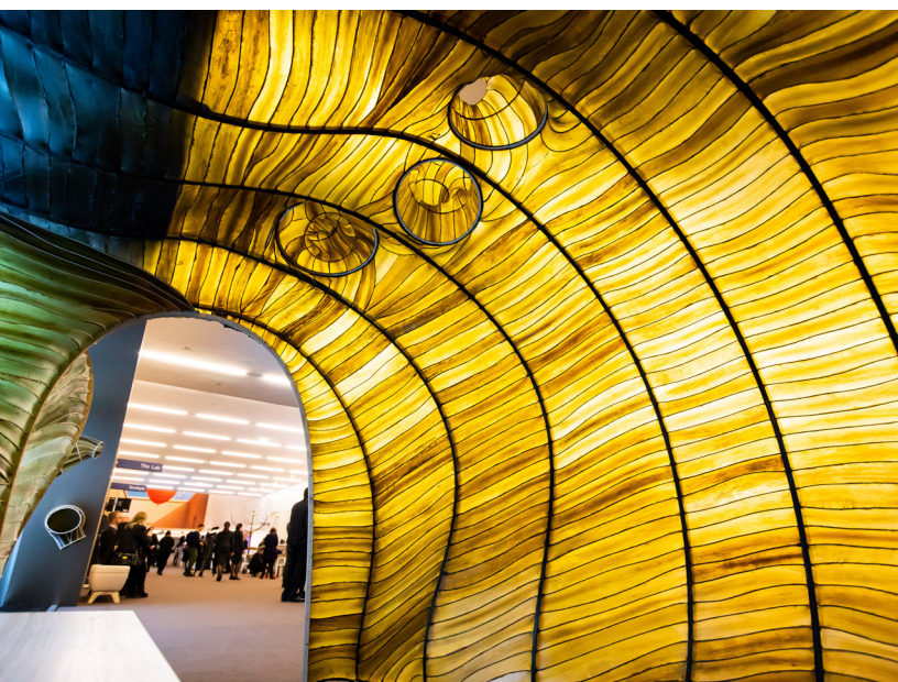
Tree of 40 Fruit featured in the Partnering with Nature exhibition at Davos.