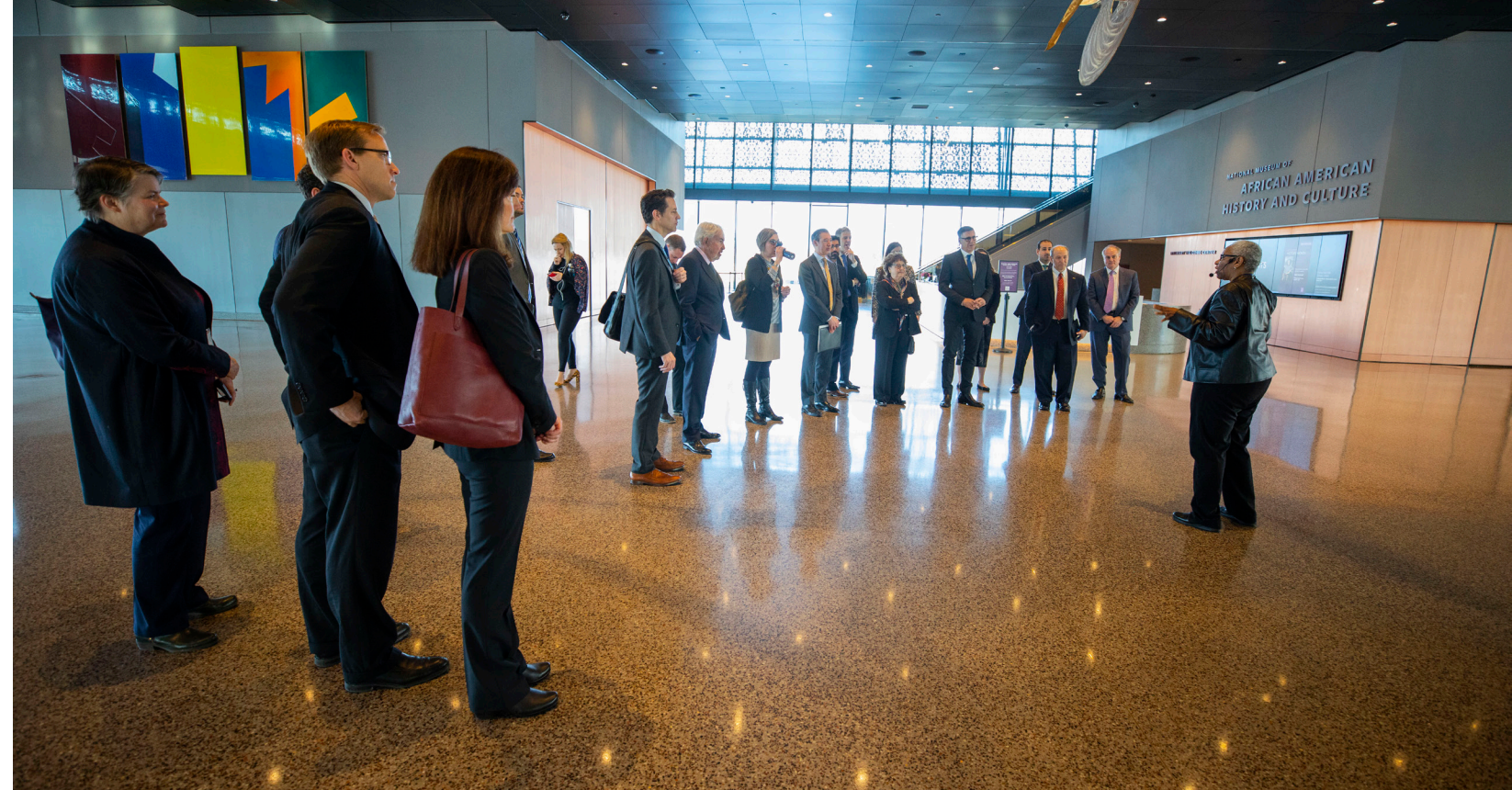
Fulbright Foreign Scholarship Board Meeting at the National Museum of African American History and Culture.