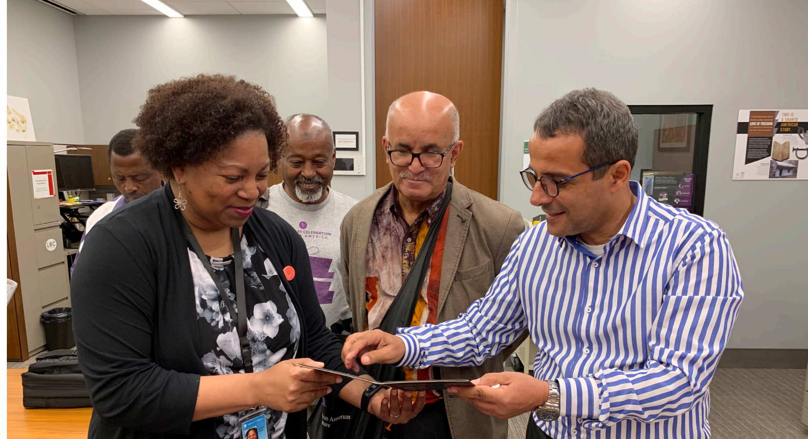
Members of the African Union visiting the Smithsonian for expert consultations present a gift for the National Museum of African American History and Culture Library collection.