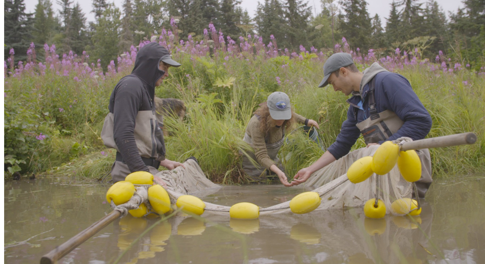
This page: From the Salmon and People Project page on the Smithsonian Global website. Facing page: From the Alonge Project video on the Smithsonian Global website.

The Smithsonian Global website shares stories from across the Institution with key international partners, and features 40 projects, 16 videos, and 75 staff from across the Smithsonian.