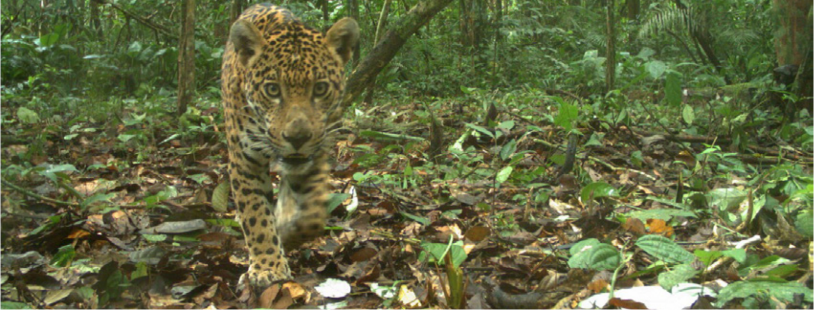
A jaguar caught on camera in August 2018 as part of a Center for Conservation and Sustainability wildlife monitoring program in Peru.

OIR is helping develop a Theory of Change for the Smithsonian’s biodiversity work in Peru aligned with current efforts underway to develop an International Strategic Framework that helps prioritize Smithsonian’s global activities. A Theory of Change identifies intermediate outcomes and the pathway required to achieve a desired long-term goal, in this case “healthy, resilient, and more productive land and seascapes”. Throughout the second half of 2020, OIR facilitated stimulating discussions among colleagues from the Conservation Commons (CC), the National Zoo (NZP) and Smithsonian Conservation Biology Institute (SCBI), the Smithsonian Environmental Research Center (SERC), the Smithsonian Marine Station (SMS), and the Smithsonian Tropical Research Institute (STRI), confirming pan-Institutional interest in a wide range of potential research opportunities. Given the Institution’s significant and deep history in Peru, strong foundation for impact-driven work, and excellent in-country relationships, this Theory of Change will strengthen Smithsonian’s ability to compete for funded opportunities for work in the country. This process has also identified the varied stakeholders and partners who must be engaged in order to achieve desired outcomes, including Peruvian government entities, large international nonprofits, local co-ops, university and academic institutions, the donor and private sector, and other relevant organizations.