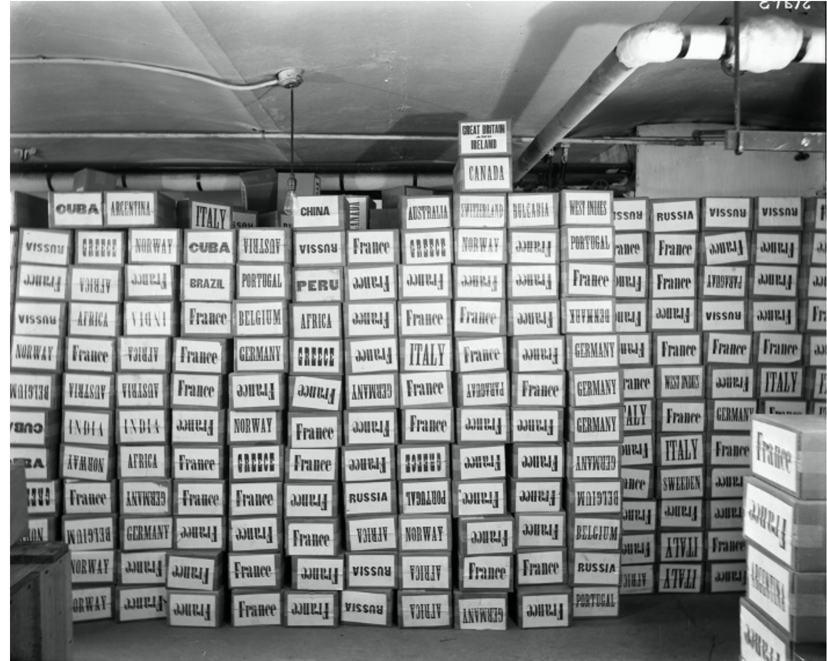
Publication packages labeled with foreign country destination, early 1900s.