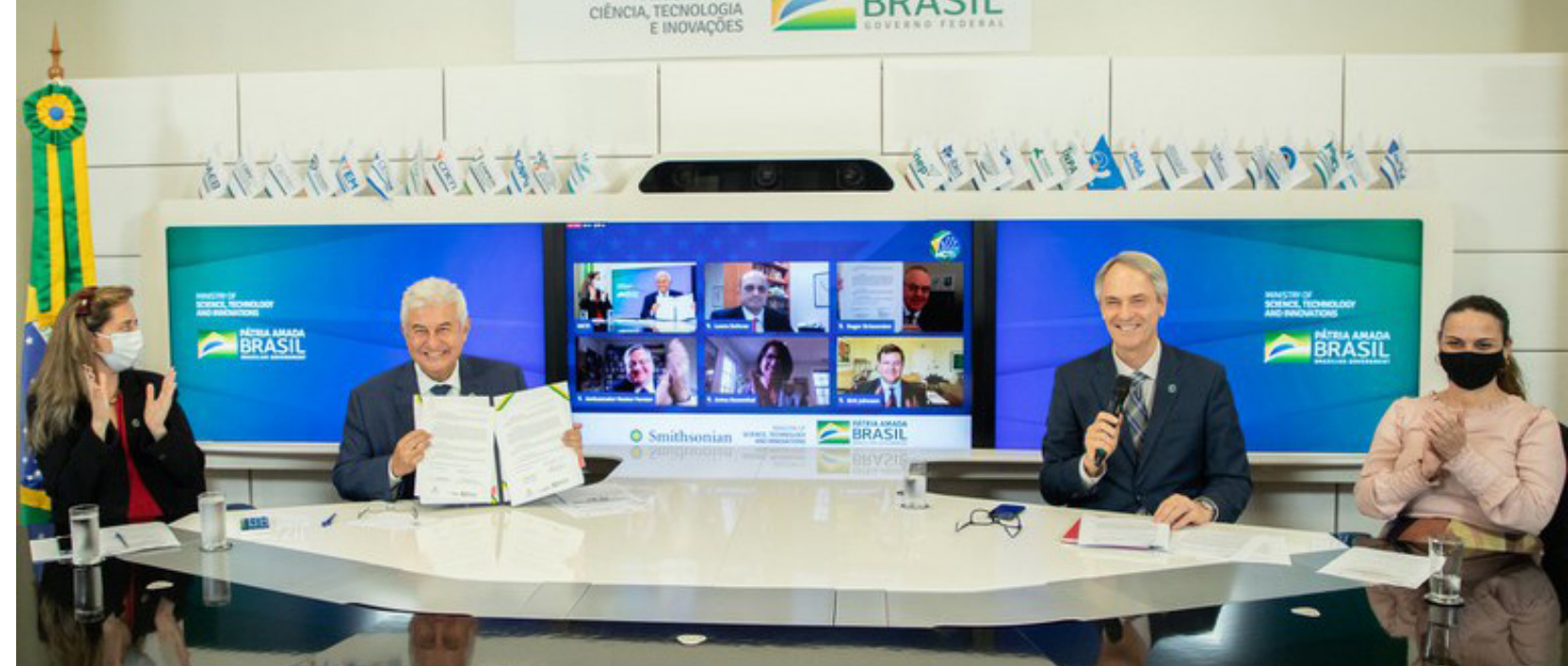
Smithsonian and Government of Brazil sign a new agreement on scientific, educational, and cultural cooperation.

2021 will mark the 175th anniversary of the Smithsonian Institution, and throughout that history its connection with Brazil has been foundational. Some of the very first plant and animal specimens in SI’s collection came from early interest in Brazil’s rich natural diversity and culture. More than 500 Brazilian researchers over the past five decades