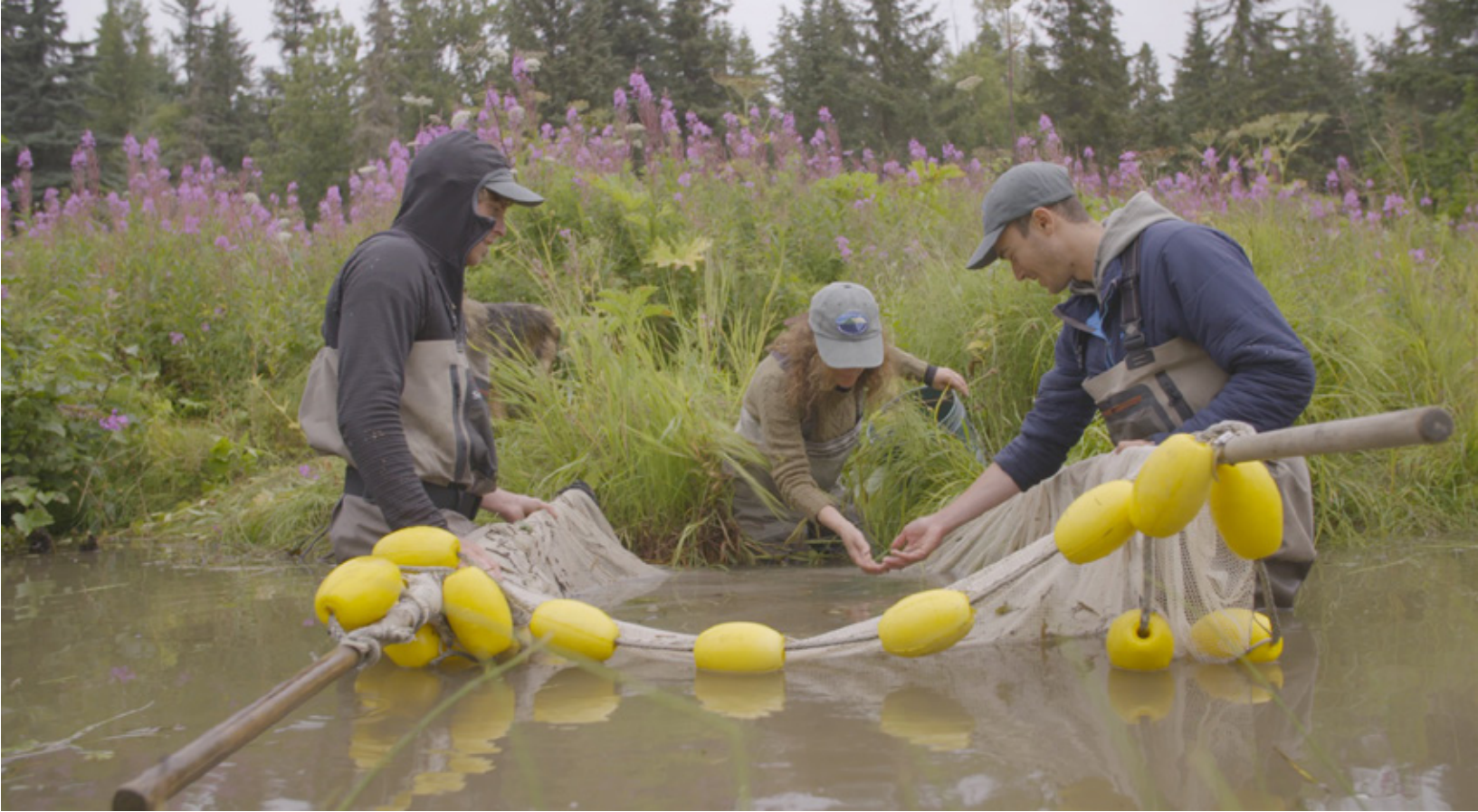
This page: From the video The Heartbeat , featuring the Salmon and People project. Photo: Smithsonian Global Facing page: From the Helping Recover and Preserve Cultural Heritage in Iraq video. Photo: Smithsonian Global

The Smithsonian Global website shares stories from across the Institution with key international partners, and features 42 projects, 17 videos, and 75 staff from across the Smithsonian.